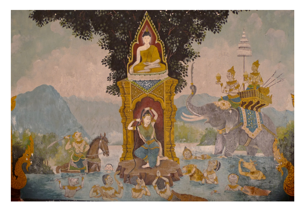
Figure 2: Wat Phra That Doi Suthep near Chiangmai

If this interpretation of the Earth Goddess is correct, it reinforces the emphasis Buddhism places on freedom from cravings. It is, therefore, unfortunate that many Thai Buddhists blindly believe in swindlers who dream up various outrageous methods to "cut the bonds of karma" for a fee, when all they need to do is work on their own desire.