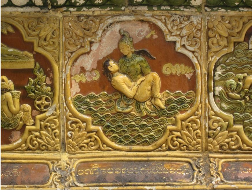
Figure 2: Glazed terracotta tile, c. 1900, Shwedagon Pagoda, Yangon (Rangoon), showing Janaka's rescue from the sea.