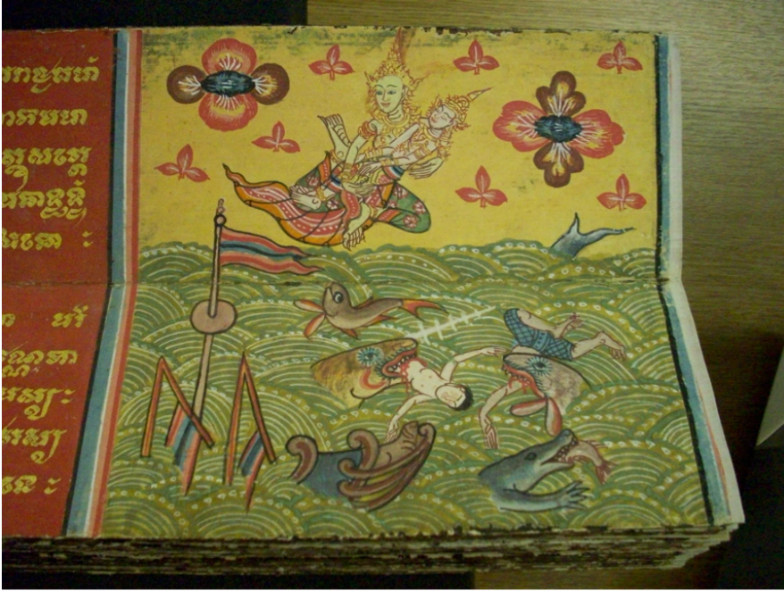
Figure 1: The scene in the sea with Janaka and the goddess Manimekhalā, protective deity of the seas, on an eighteenth-century Siamese samut khoi (folding book) now in the Bodleian Library (Ms. Pali a. 27 R).

jewels to the passengers, and everyone goes home with plenty of wealth. As in the case of the magical boat of the Saṅkha Jātaka and the wonderful islands that welcome Mittavinda, travel at sea offers great “jewels” in the form of the seven kinds of gems we see so often in subsequent Buddhist mythology. The Bodhisatta, however, unlike Mittavinda, knows how to exercise control in the midst of the great wealth and “jewels” that can be found in the ocean. His wisdom is intuitive, and based, as his declaration of truth attests, on non-harm, demonstrated in his care for his passengers. He does not become intoxicated, and brings good fortune, wealth and good luck to those whom he takes on his “boat”. This gives an anticipation of his role in his final life, and an enactment of an uncourtly heroism different from that demonstrated in contemporary Sanskrit drama and poetry.