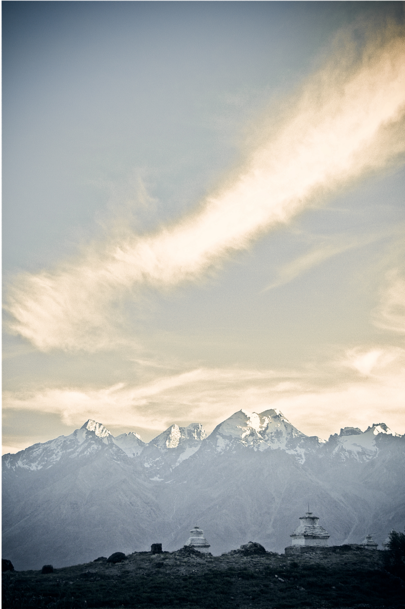
Figure 20: Near Karcha Monastery.