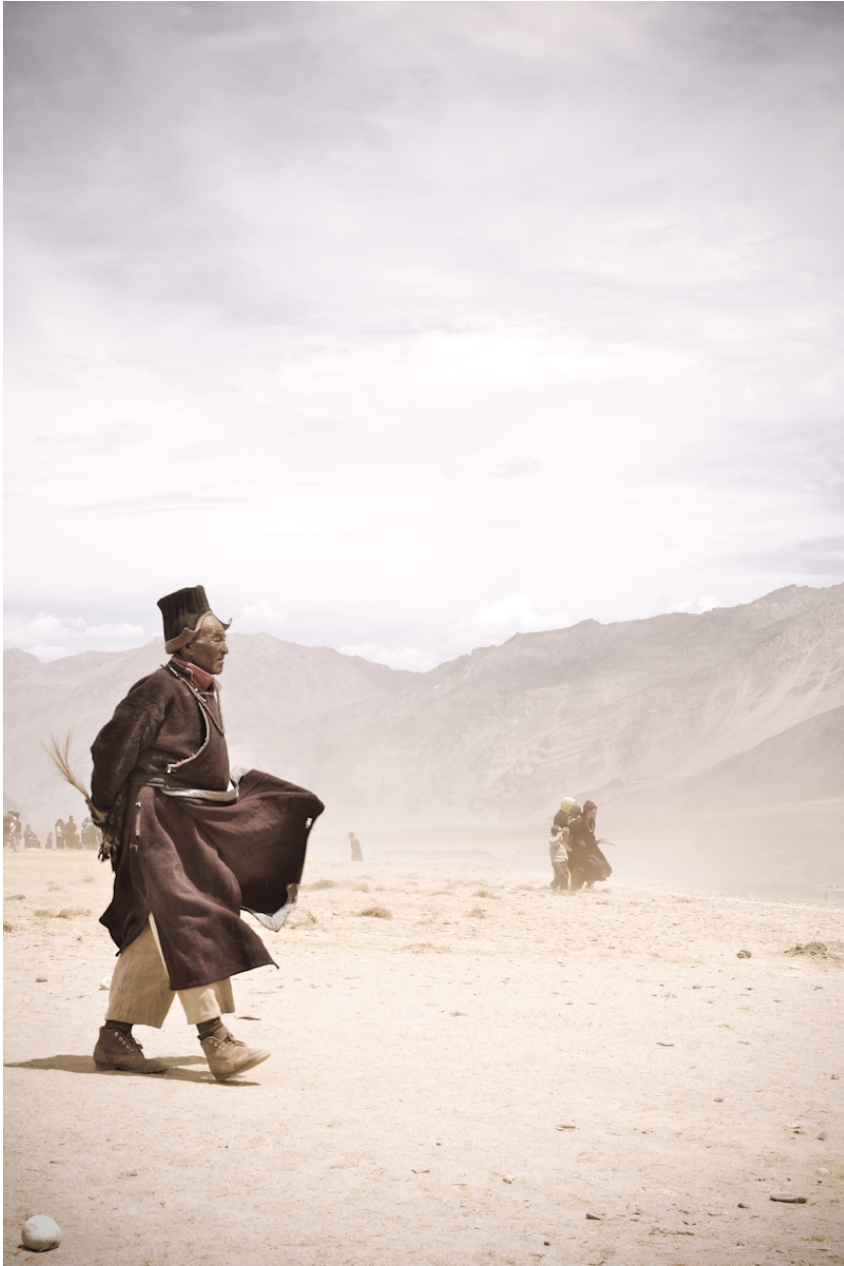
Figure 4: Pilgrim.