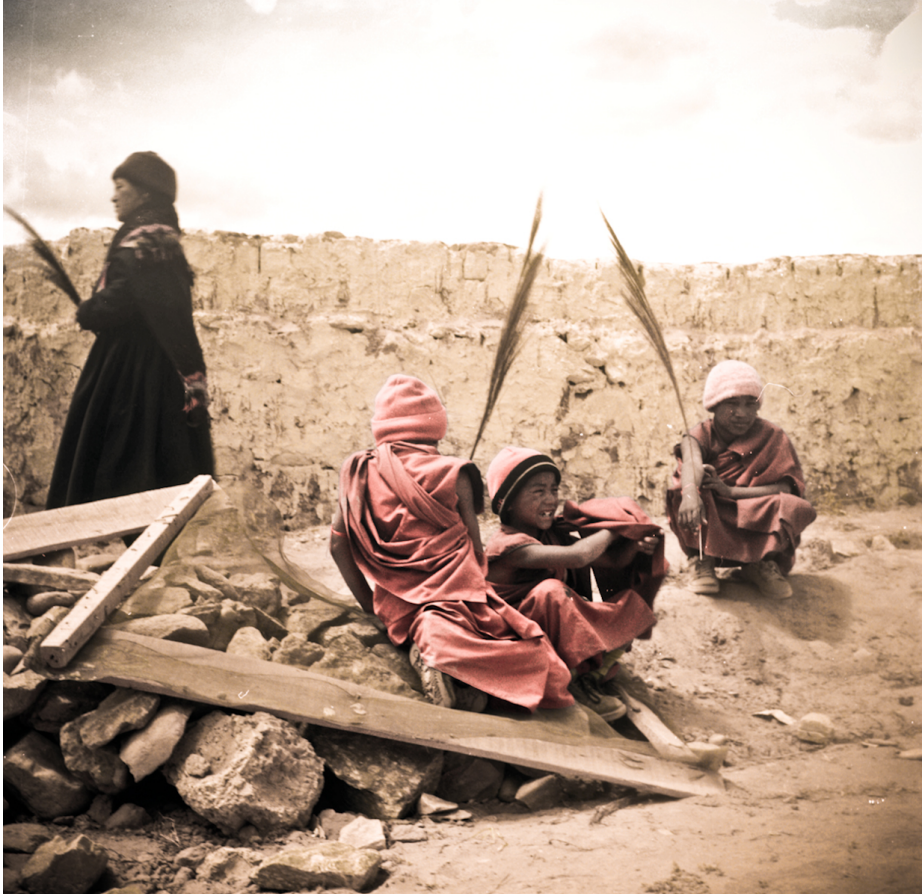
Figure 15: Monks carrying branches blessed by the Dalai Lama.