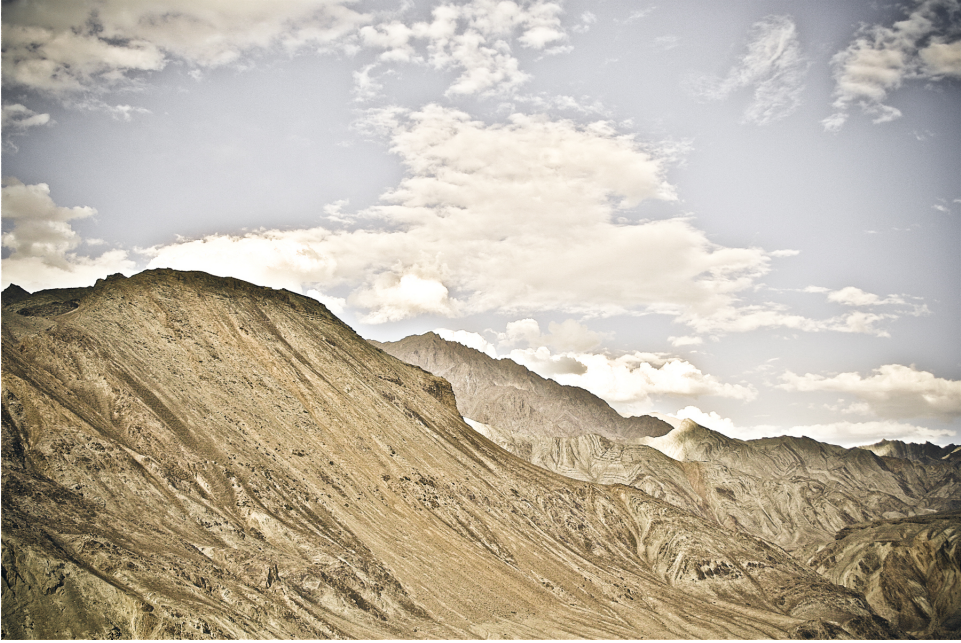
Figure 11: A mountain clad in velvet.