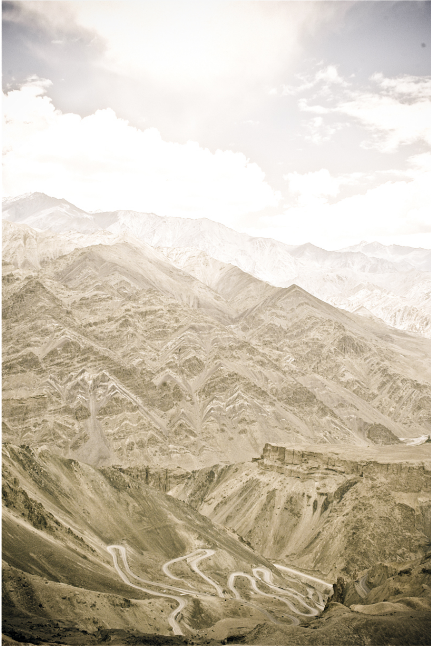
Figure 9: Silence.