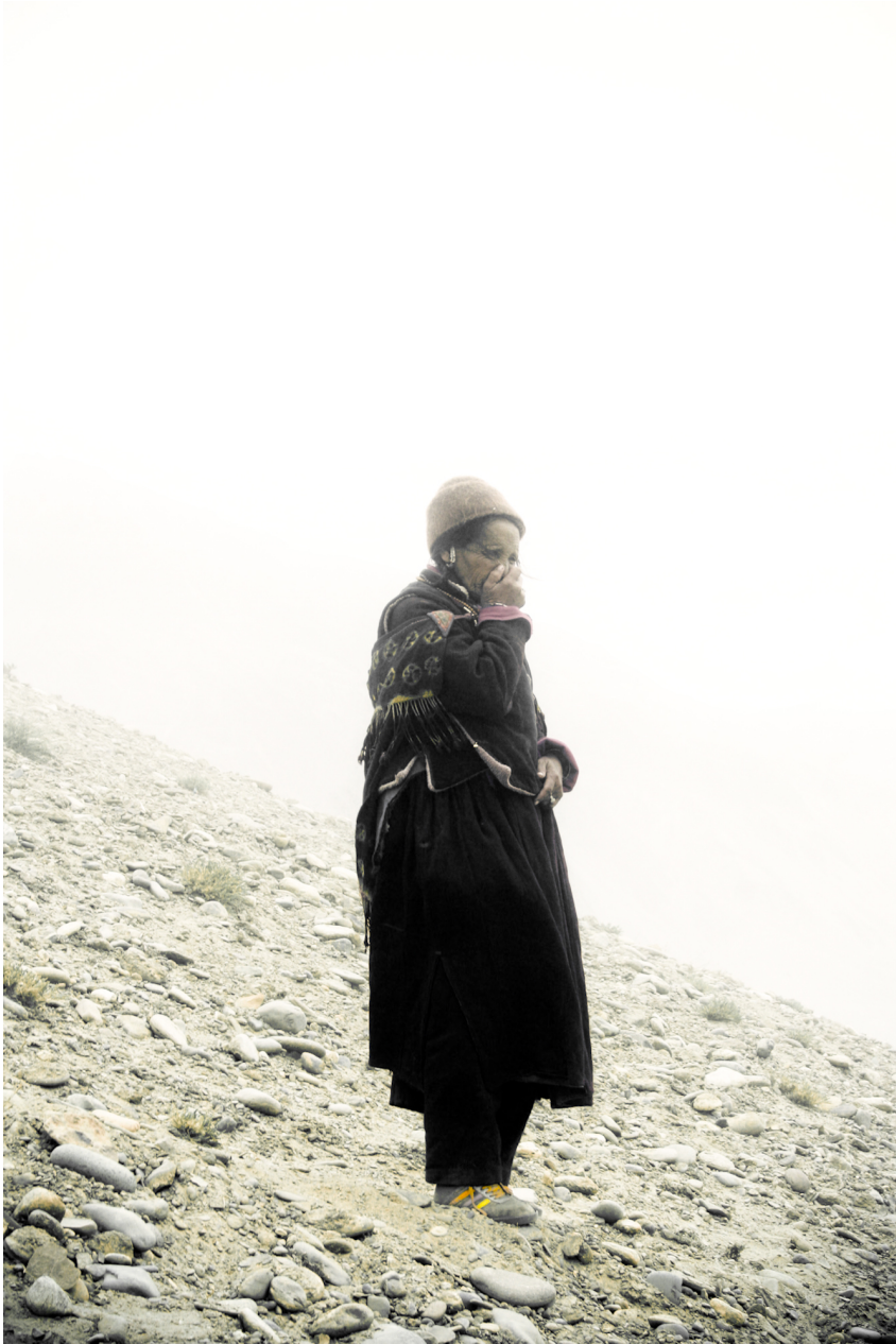
Figure 10: Human frailty.