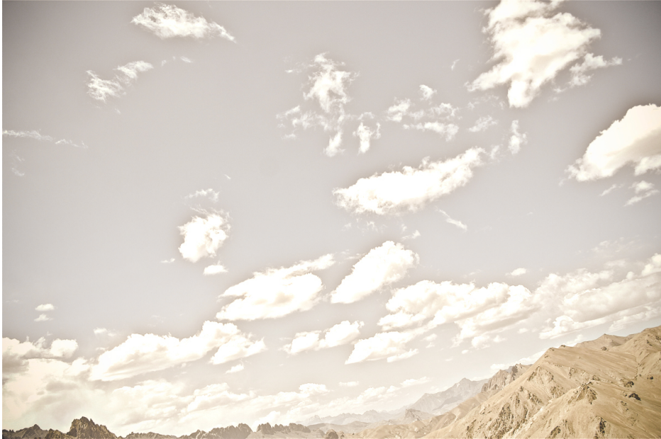
Figure 8: Clouds like prayer flags.