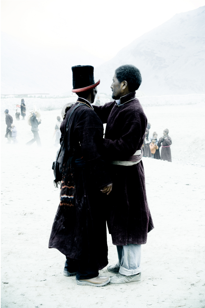
Figure 17: Leaving the temple at Padum, the embrace of a son sees the father off and closes the cycle of teachings imparted by the XIV Dalai Lama.