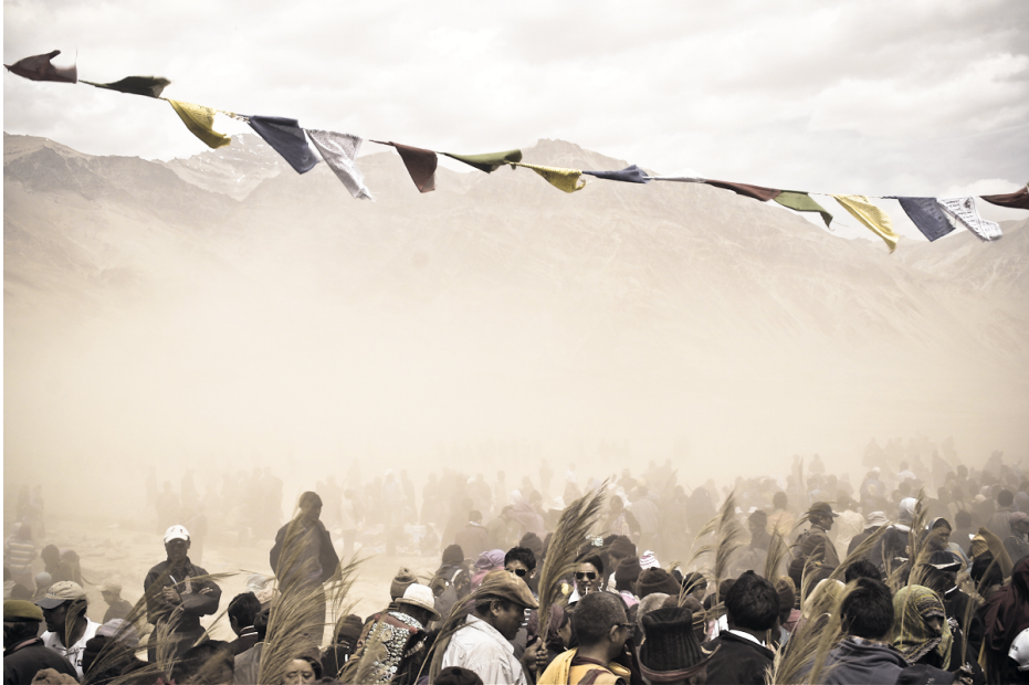
Figure 5: In August 2005, hundreds of pilgrims descended from every corner of the mountain to hear the Dalai Lama preach.