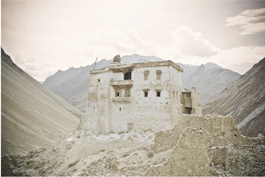
Figure 7: The castle in Zangla, a small principality near Padum. Csoma de Körös stayed here in 1823; it used to house the royal family.