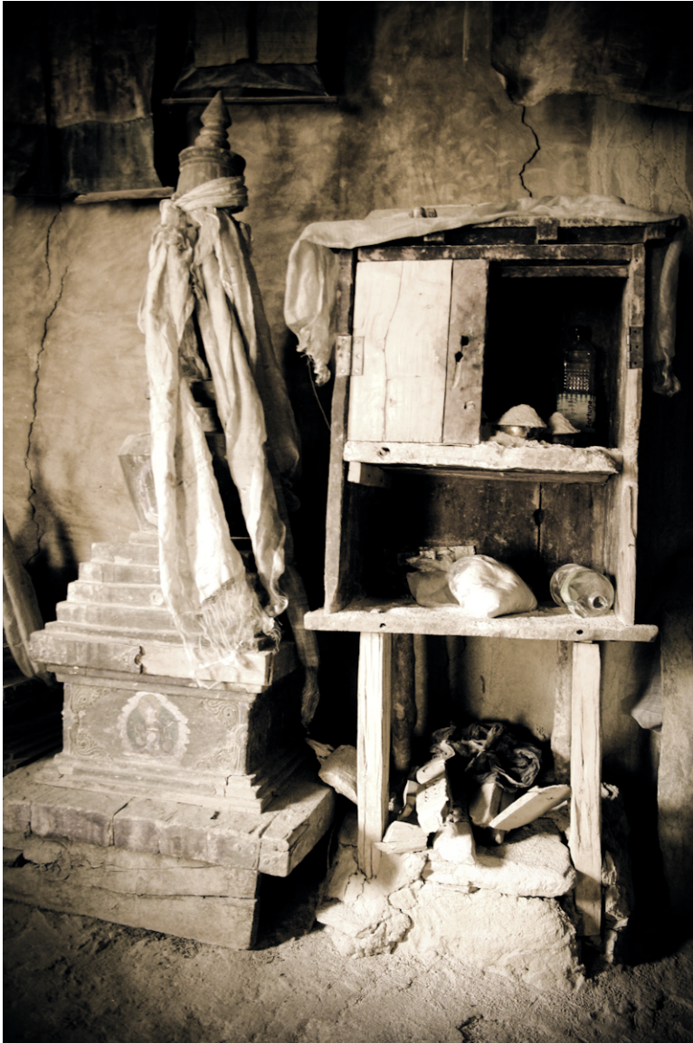
Figure 2: Csoma's room. In 1823 Alexander Csoma de Körös, guided by Sangs-rgyas Phun-tshogs, spent 16 months in a cell in Zangla, studying manuscripts to compile the first Tibetan-English dictionary.