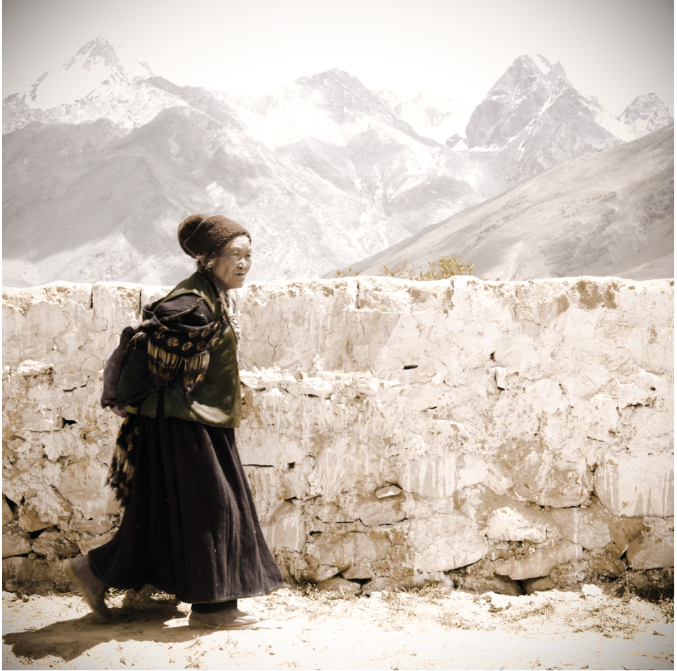
Figure 16: Following the Eightfold Path.