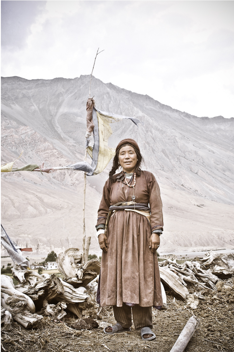
Figure 14: In Zanskar polyandry is still common. This lady is on the roof of a house in which live her two husbands and their children.