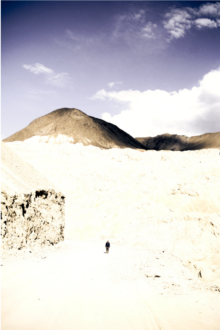
Figure 3: Solitude.