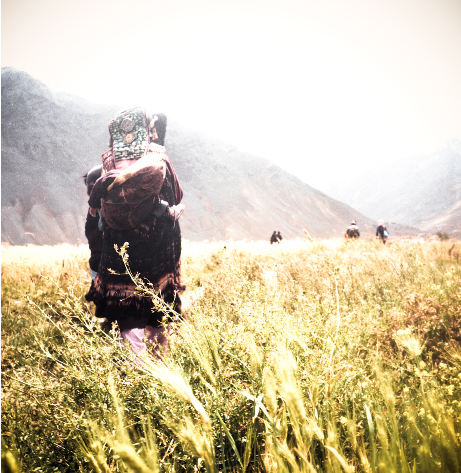
Figure 1: Near the main temple in Padum. The woman with a baby on her back is wearing a perak , the traditional headdress of Ladakh made of turquoises.