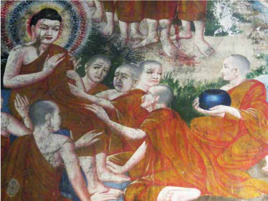
Figure 9. The Buddha sitting down to drink water being brought by Ānanda, on his way to Kusinārā to reach final extinction. Wat Prasat Andet, Kompong Thom province, Cambodia, late 20th century