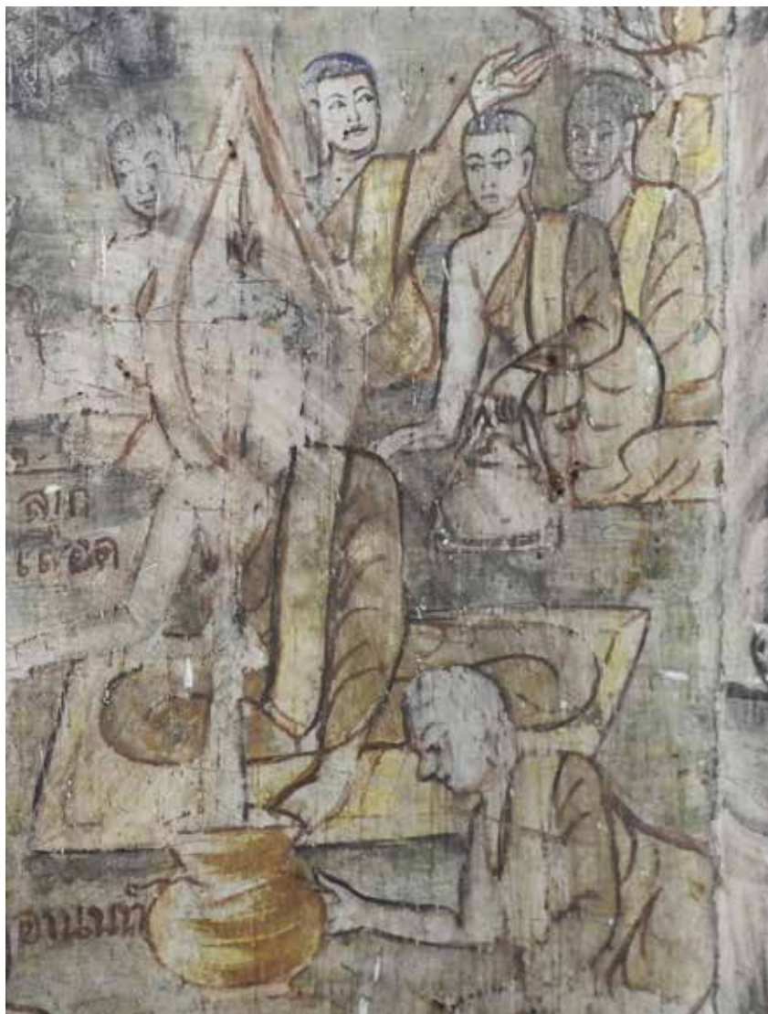
Figure 6. The Buddha 'vomiting blood' after the last meal (the Thai caption to the viewer's left clearly reads ลาก เลือด/lak lueat, 'vomiting blood', see n. 40), with Ananda (Th. อานนท์/Anon) below him, catching the purging. Wat Huai Kaeo, Phitsanulok province, Thailand, mid-20th century