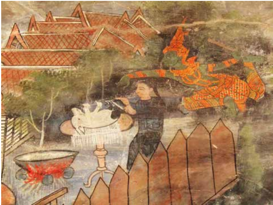
Figure 2. The Buddha's last meal, consisting of pig's meat, being prepared by Cunda, and infused with divine nutriments by Sakka. Wat Kasattrathirat Worawihan, Ayutthaya province, Thailand, c. 1879