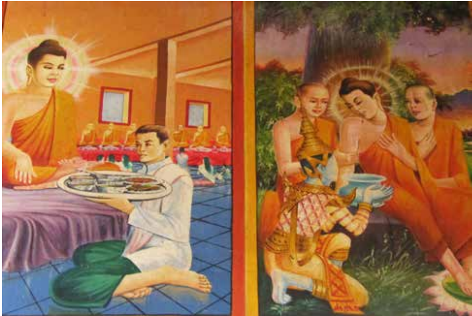
Figure 10. Two panels depicting the meritorious offering of the last meal by Cunda to the Buddha (left), and the Lord sitting down and about to vomit blood in Sakka's vessel (right). Wat Bakong, Siem Reap province, Cambodia, early 21st century