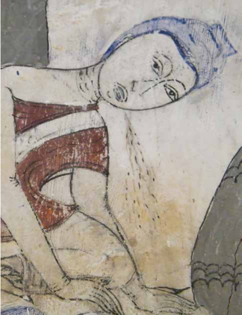
Figure 5b. Detail of the Buddha, showing his stomach distress and vomiting blood