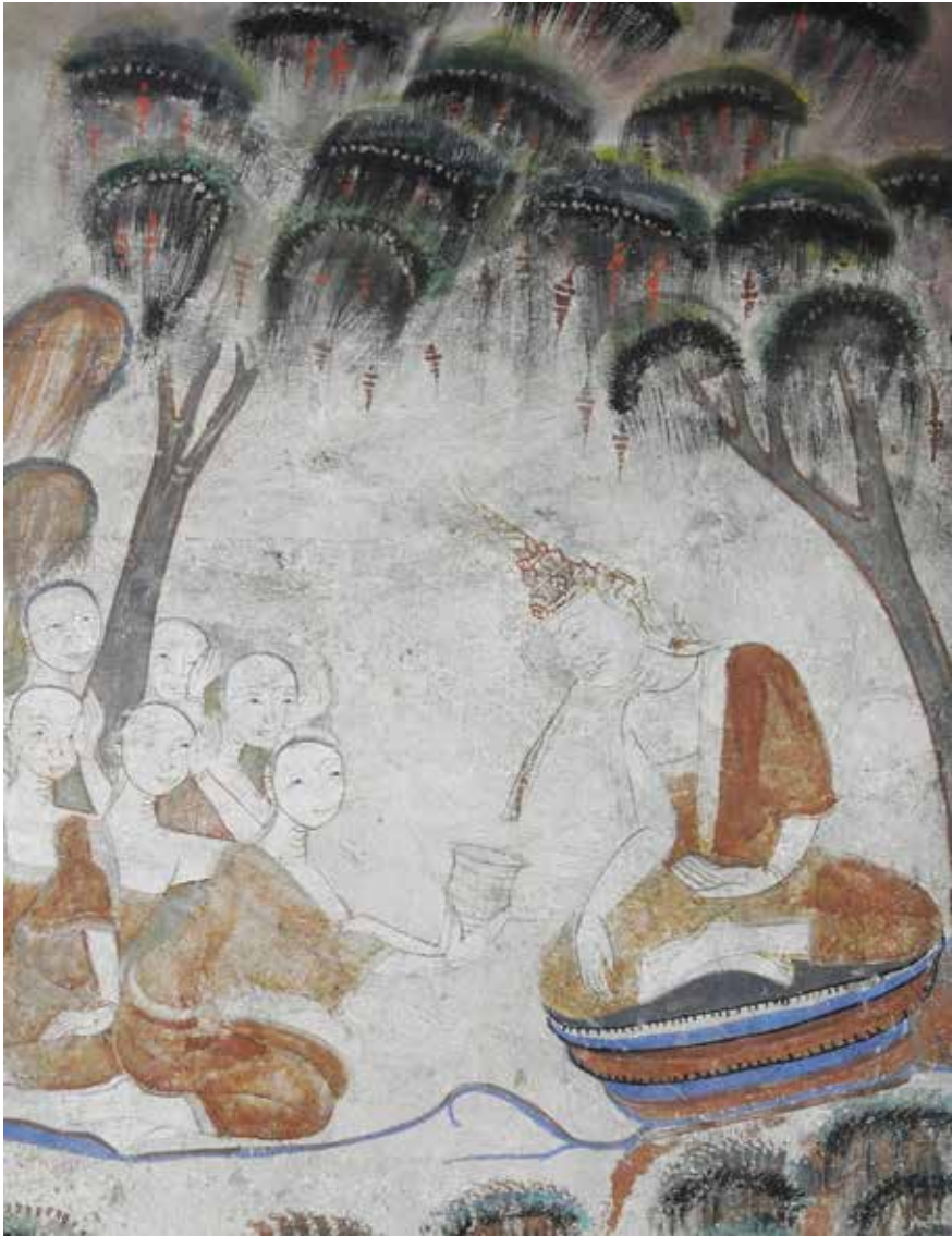
Figure 4. The last illness showing the Buddha vomiting blood, and the grief expressed in the faces of his followers. Wat Photharam, Mahasarakham province, Thailand, early 20th century