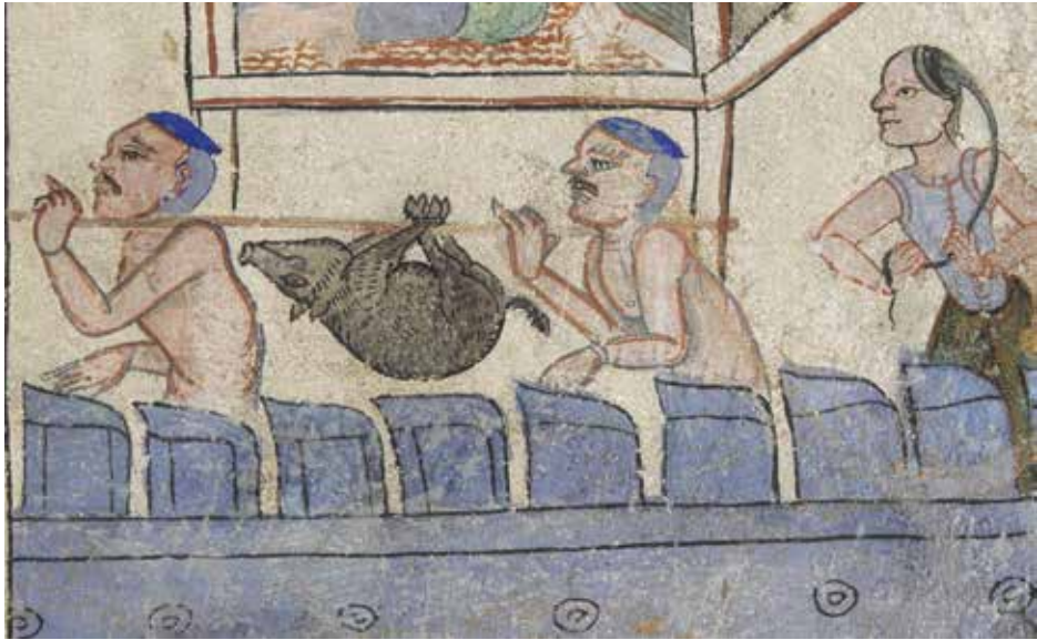
Figure 3. Cunda and his attendants preparing the last meal, consisting of wild boar's meat (already dead?), for the Buddha and his retinue of monks. Wat Photharam, Mahasarakham province, Thailand, early 20th century