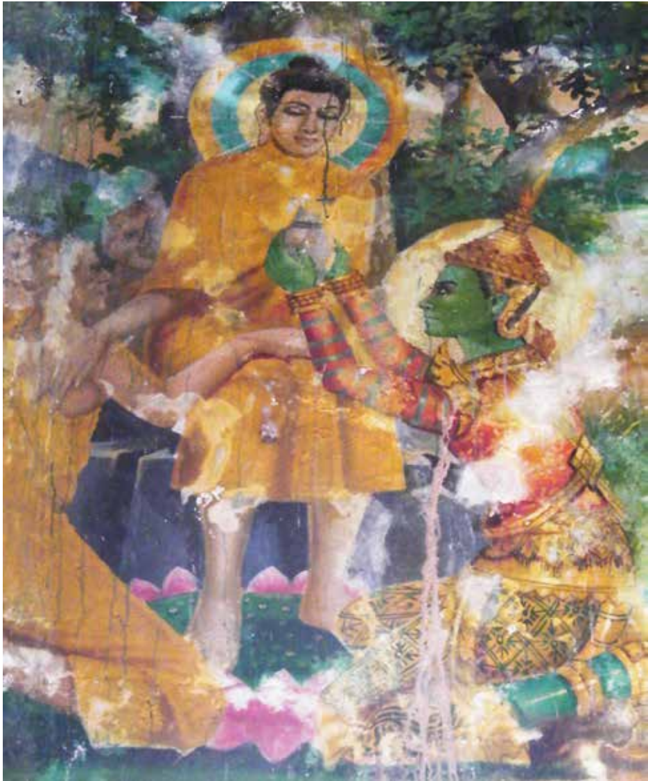
Figure 8. The Buddha sitting down with Sakka getting ready to catch his vomit. Wat Phnom Baset, Kandal province, Cambodia, mid-20th century (Photo courtesy of Nicolas Revire, July 2014)