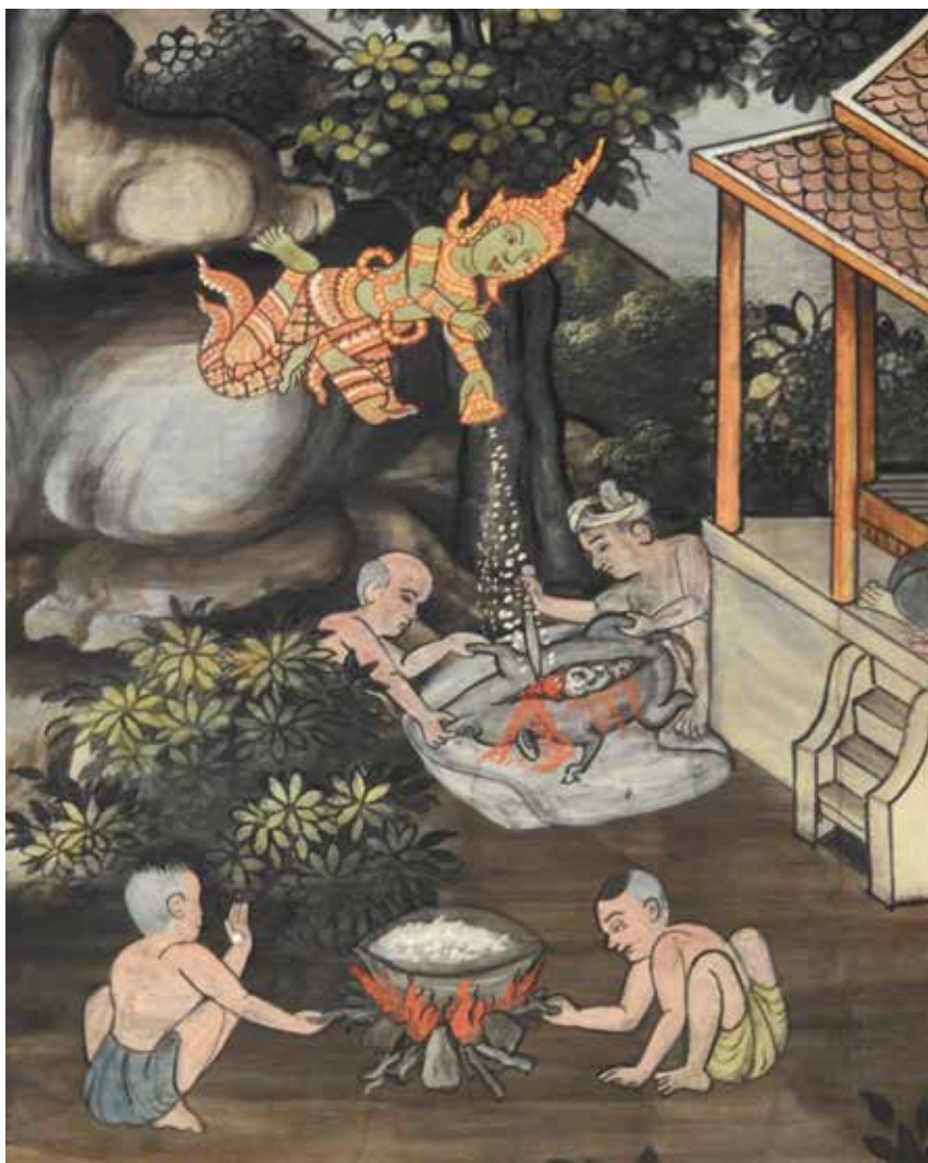
Figure 1. Sakka, Lord of the devas, sprinkling the divine nutriment on the Buddha's last meal consisting of pig's meat. Wat Arun Ratchawararam, Bangkok, Thailand, repainted in the late 19th century (Photo courtesy of Nithi Nuangjamnong, September 2017)