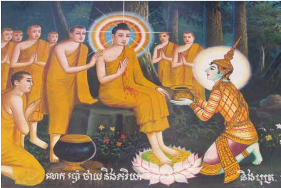
Figure 11a. The Buddha vomiting blood and attended by his retinue of monks, with Sakka trying to catch the purging in his vessel. Angkor Wat (modern pagoda), Siem Reap province, Cambodia, early 21st century