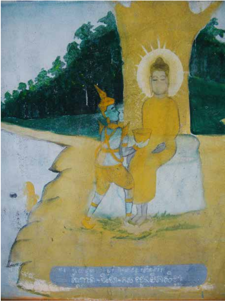
Figure 7. The Buddha sitting down to drink water being fetched by Ānanda, and Sakka getting ready to catch his vomit. Stung Treng province, Cambodia, early 20th century (Photo courtesy of Nicolas Revire, July 2014)