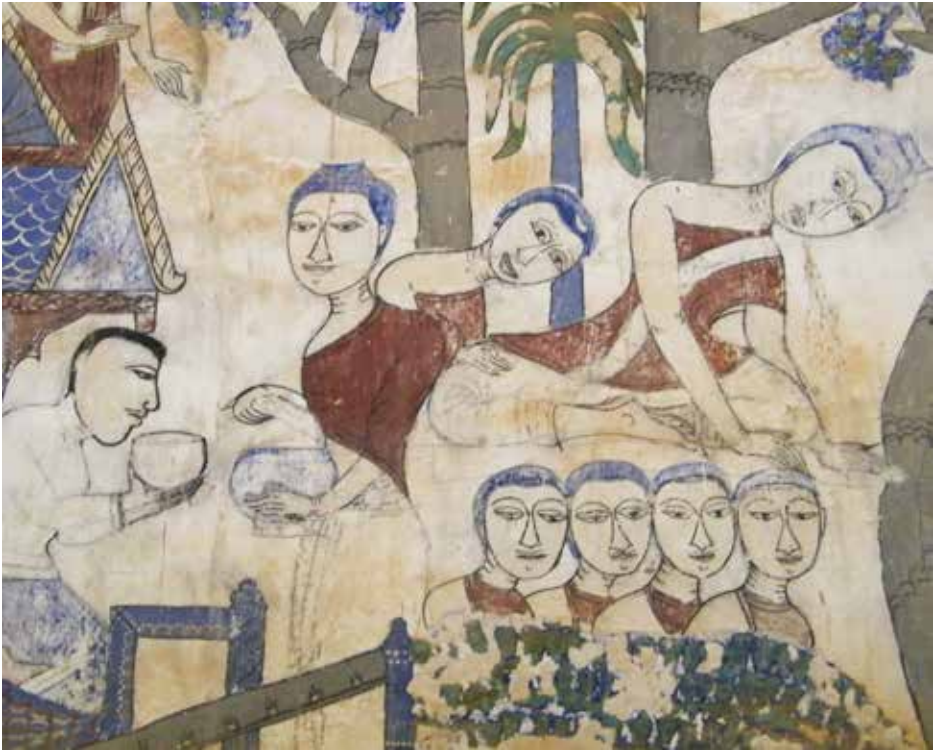
Figure 5a. The last meal offered by Cunda and the subsequent illness of the Buddha leading to his demise. Wat Ban Yang, Mahasarakham province, Thailand, early 20th century